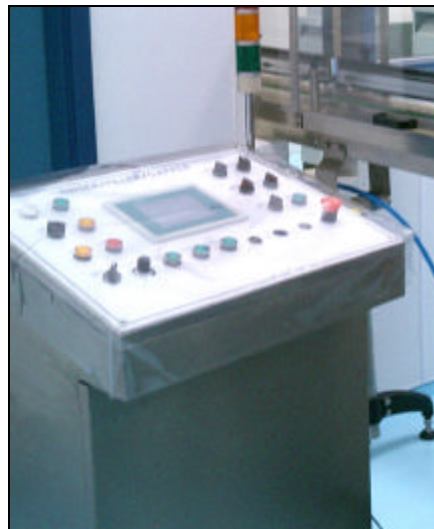
Touch Screen Control

ZYI supplies complete bottling lines ranging from 70 BPM to 700 BPM for water, juice, wine, carbonated soft drink, chemical, sauces, oil, and etc..