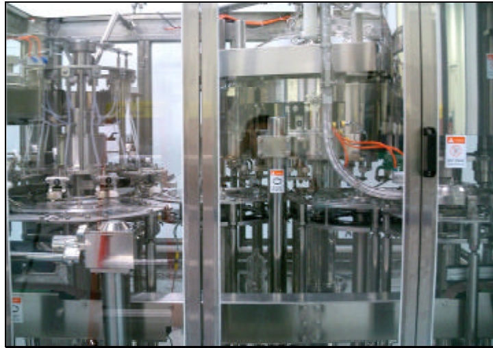
Rinser/Filler/Capper Close Up View